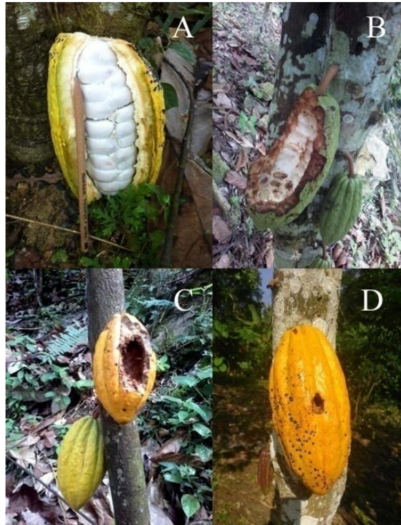
Figure 1. Cocoa pods without damage (A, note the mucilage that coats the seeds), squirrel-damaged (B and C), and woodpecker-damaged (D, note hole size and shape).