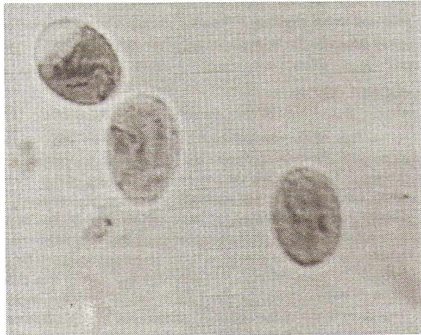
FIGURE 2. Giardia CYSTS RECOVERED FROM CALVES FAECES SHEATER'S SUGAR SOLUTION. 40X.

was washed and rinsed with a gentle stream of buffer solution, until the excess detection reagents and counterstain were removed. The slide was placed on a clean paper towel to remove the excess of buffer. One to two drop of mounting medium was added to the slide and coverslip was applied. Each well was thoroughly scanned at 100-200x magnification.