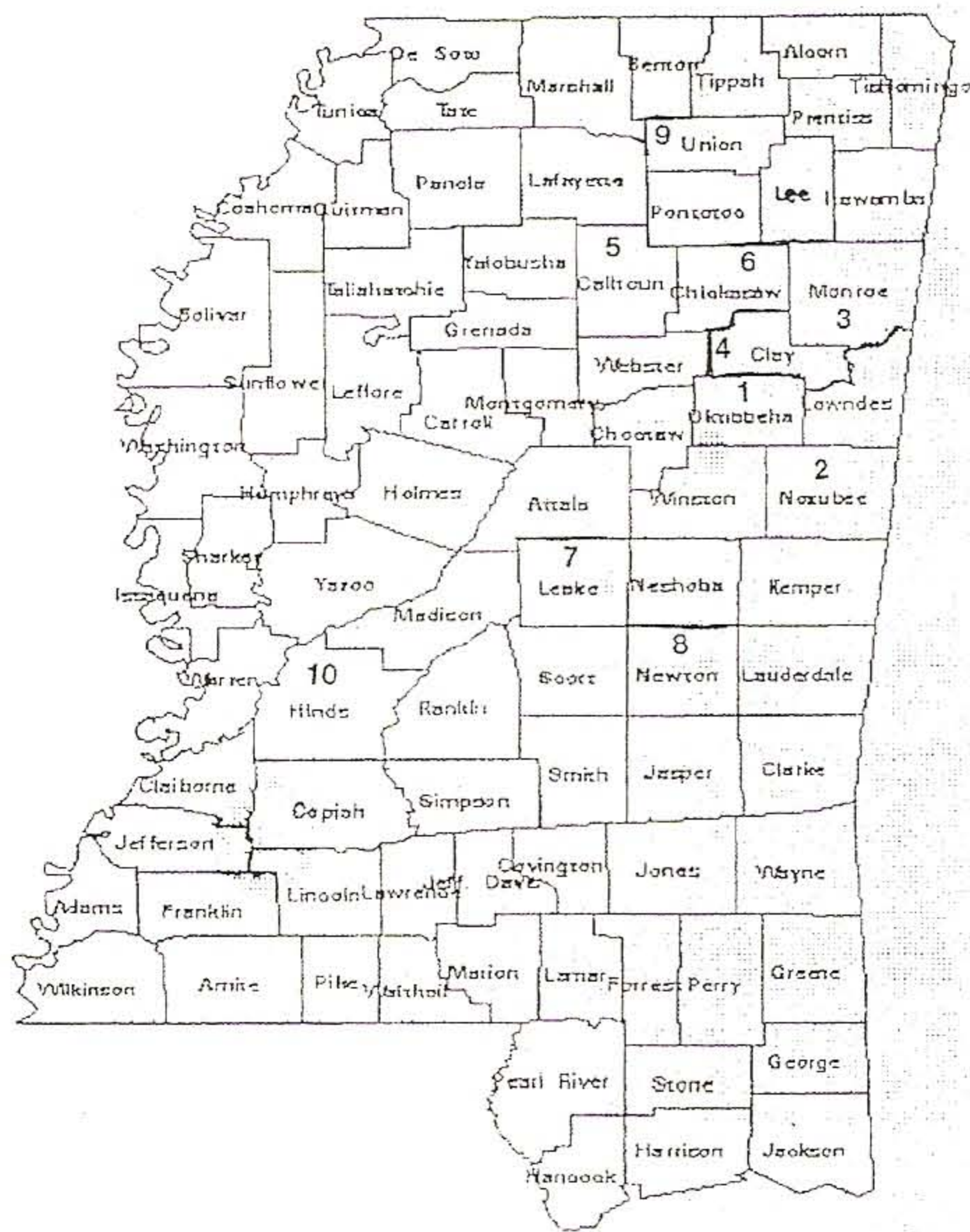
FIGURE 3. PREVALENCE OF Cryptosporidium , Giardia AND Eimeria INFECTIONS IN CALVES IN MISSISSIPPI STATE, USA. COUNTIES: 1- 43.7%, 2- 40.1%, 3- 31.8%, 4- 100%, 5- 90%, 6- 22.2%, 7- 7.8%, 8- 71.8%, 9- 57.1%, 10- 71.4%.

>10 weeks old. There was a significant correlation among animal's infection and the county in which the farm was located. The county number 4 had a higher incidence of infestation (100%), followed by the number 5 (90%) and number 8 (71.87%), FIG. 3.