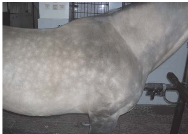
FIGURE 5. SAME HORSE SHOWN IN FIG.4, AFTER INITIAL MEPYRAMINE MALEATE TREATMENT, URTICARIAL LESIONS WERE DISAPPEARED IN THE HORSE ABOVE/ CABALLO EN LA MISMA SE MUESTRA EN LA FIG. 4, DESPUÉS DEL TRATAMIENTO INICIAL CON MEPYRAMINA MALEATO, LESIONES DE URTICARIA FUERON DESAPARECIDAS EN EL CABALLO, ARRIBA.