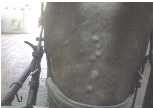
FIGURE 2. URTICARIAL WHEELS LOCATED ON THE HEAD/ RONCHAS DE URTICARIA SITUADAS EN LA CABEZA.