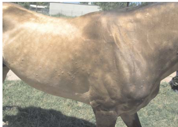
FIGURE 4. MULTIPLE WHEELS LOCATED ESPECIALLY ON THE THORAX, BEFORE TREATMENT/ MÚLTIPLES PÁPULAS ENCONTRADAS ESPECIALMENTE EN EL TÓRAX, ANTES DEL TRATAMIENTO.