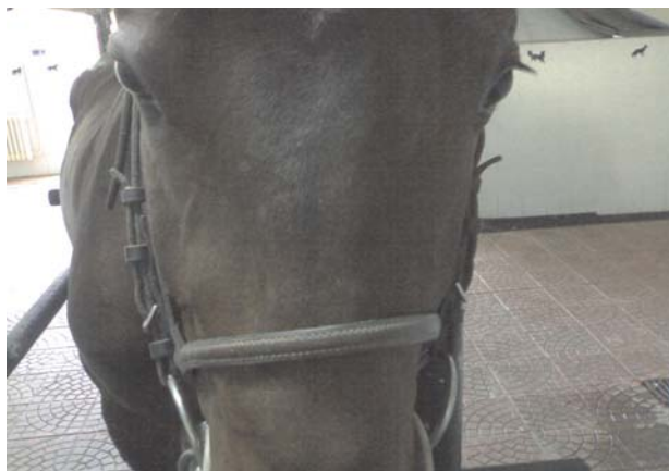
FIGURE 3. SAME HORSE SHOWN IN FIG.2, 24 HOURS AFTER INITIAL TREATMENT. NOTICE CLINICAL HEALING AND DISAPPEARANCE OF WHEELS/ CABALLO EN LA MISMA SE MUESTRA EN LA FIGURA 2, 24 HORAS DESPUÉS DEL TRATAMIENTO INICIAL. NOTIFICACIÓN DE LA CURACIÓN CLÍNICA Y DESAPARICIÓN DE RONCHAS.