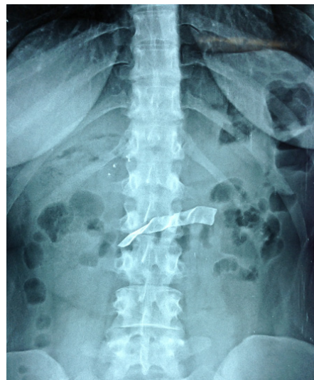
Fig. 1. Plain abdominal radiograph showed a radio-opaque string as well as a whorl-like opacity

The patient went to the operating room and a laparotomy was performed. The retained sponge was dissected out with no intestinal resection. The duodenal defect was closed. The patient did well postoperative and was successfully discharged on the sixth day.