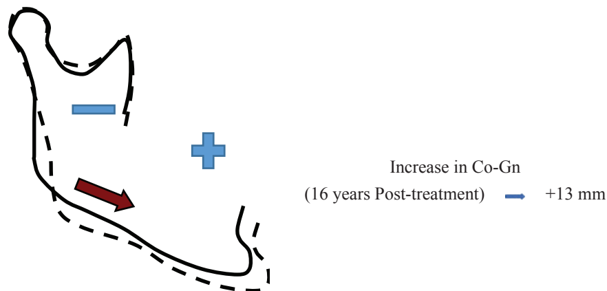
Fig. 5. Superimposition of the mandible (Continuous line: 13 years three months of age - Dotted line: 31 years nine months of age).

The study by Baccetti and Franchi 18 identified the Co-Go-Me angle with a predictive power of 80.4% reliability. According to this model, a Co-Go-Me angle between 124° and 128.5° will respond favorably to orthopedic therapy; a Co-Go-Me angle greater than 128.5° will react unfavorably to therapy; and those patients who initially present a Co-Go-Me angle of less than 124° will have a great response to treatment; however, these authors did not present long-term stability results. In the present report, this measure (122°) correctly predicted the largely favorable response to treatment.