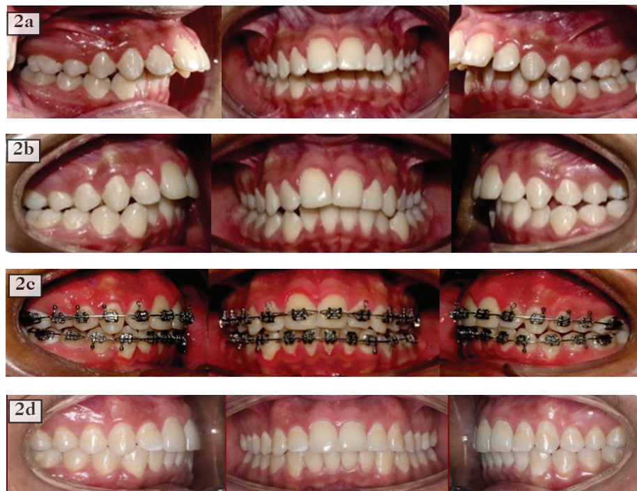
Fig. 2. Intraoral photographs, Right Lateral, Frontal, and Left Lateral Views: (2a) Pre-treatment at 13 years and three months of age; (2b) after Herbst therapy at 14 years and eight months of age; (2c) at the end of bracket treatment at 15 years and eight months of age; (2d) 16 years after treatment completion at 31 years and nine months of age.