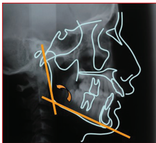
Fig. 3. (3a) Initial Cephalometry; (3b) After treatment; (3c) 16 years post-treatment...