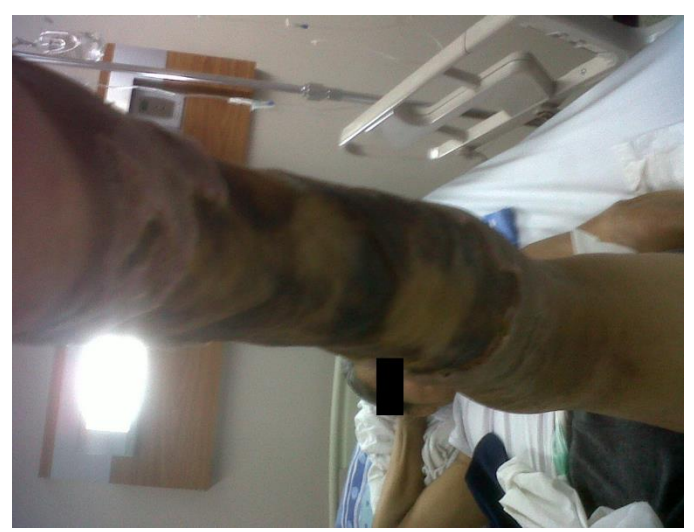
Figure 2. View of the calf region where the most extensive lesion is observed, covering 80% of the circumference of the left leg

Therapeutic focus and assessment: intravenous antibiotic treatment with meropenem and clindamycin was started. The lesions were cleaned daily using alginic acid and hydrocolloids. Dressing were changed daily in a sterile fashion. Glycemic control was achieved with regular insulin.