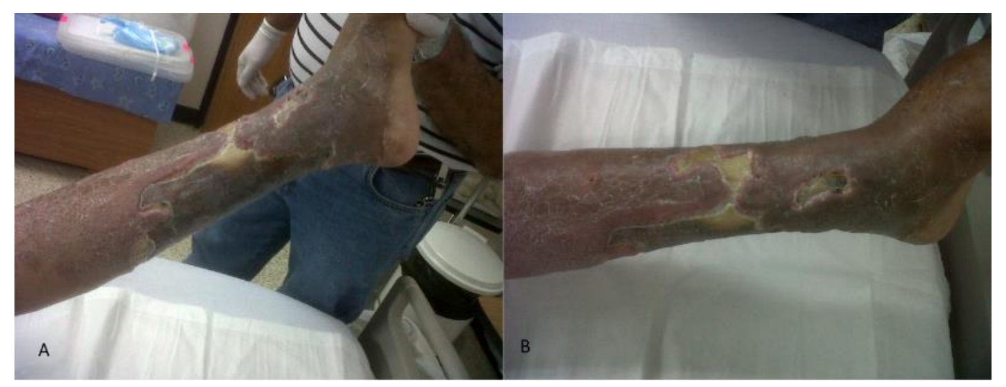
Figure 5.3 days after the start of treatment with topical betamethasone/gentamicin with a considerable reduction of perilesional edema