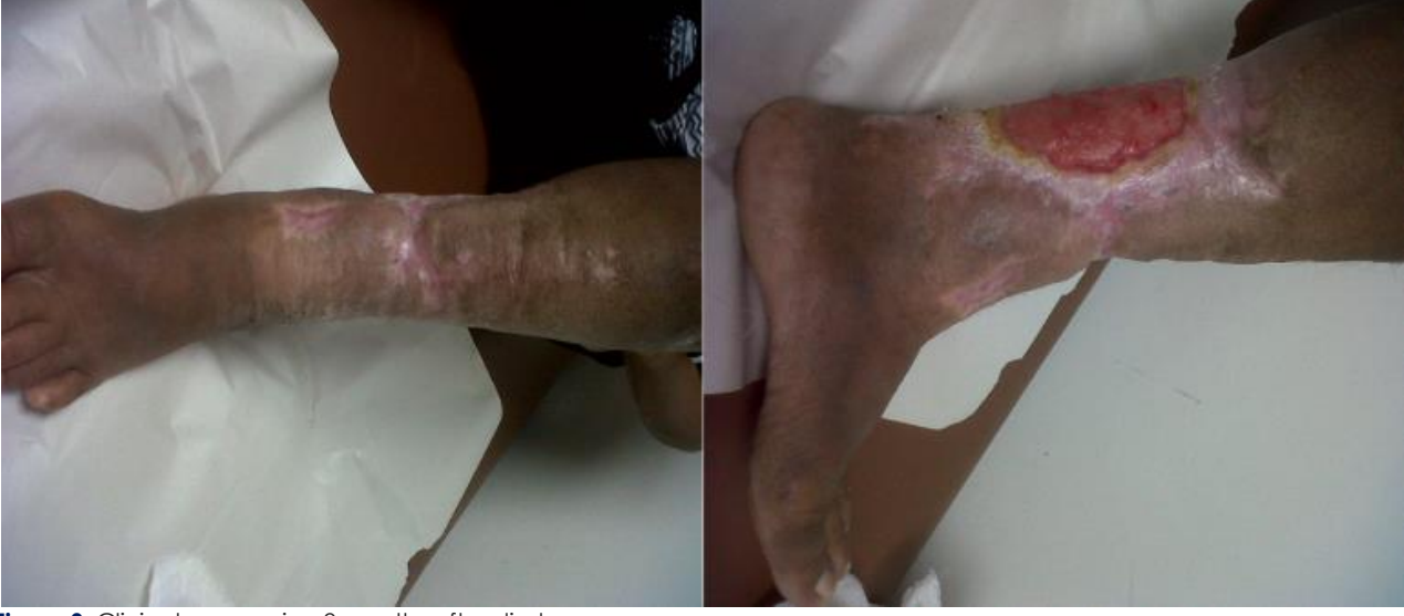
Figure 9. Clinical progression 9 months after discharge.

Although its ethology is poorly defined, it is related to some autoimmune inflammatory diseases such as IBD, RA, Ankylosing Spondylitis, Systemic Lupus Erythematous and Sjogren's syndrome. It has been associated with lymphoproliferative disorders (Hairy Cell Leukemia, Acute Myeloblastic Leukemia), Monoclonal Gammopathy and other malignancies in more than 50% of the cases (11).