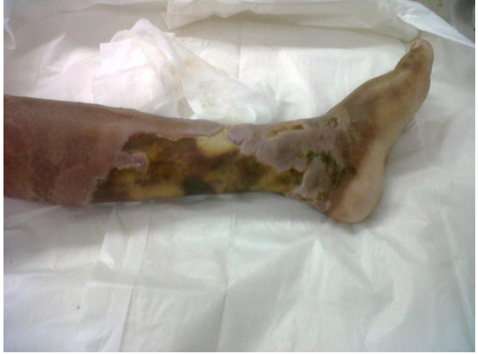
Figure 1. Extensive confluent ulcers involving two-thirds of the left leg

Diagnostic focus and assessment: initially, the managing diagnosis was cellulitis vs. necrotizing vasculitis and the working included swab and culture of the lesions that ultimately showed Escherichia coli . The bacteria were sensitive to carbapenems and aminoglycosides and resistant to quinolones.