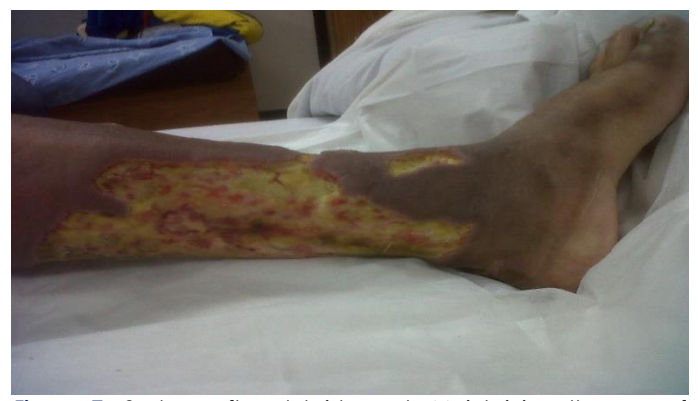
Figure 7. 8 days after debridement. Maintaining the use of betamethasone/gentamicin. Granulation tissue is observed but edema persisting at the edges. This day the patient was discharged since clinical improvement was noticed, she was scheduled for outpatient follow-up