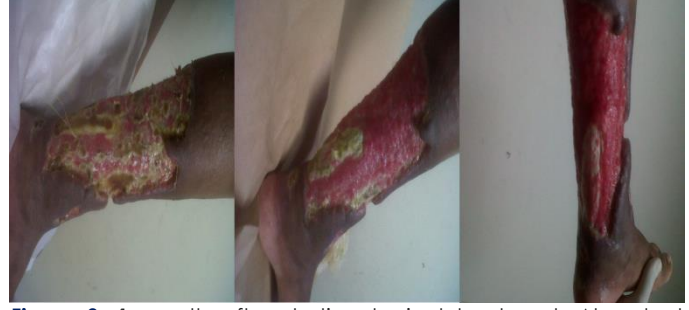
Figure 8. 1 month after starting topical treatment. Abundant granulation tissue with fewer areas of fibrin, which was withdrawn with scalpel in the office, without presenting pathergy phenomenon