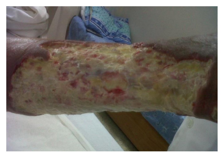
Figure 4. Status after Surgical Debridement. There is evidence of subcutaneous cellular tissue and muscle aponeurosis compromise in some points

From this point forward, daily dressing changes were done using 0.05% topical Betamethasone combined with 0.1% Gentamicin cream. After three days, significant improvement was observed (Figure 5). This also correlated