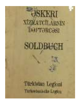
Figure 1: Soldier's Book (Archive of Internal Affairs

information about birth, profession, the date of getting the uniform, its items, as well as other official information.