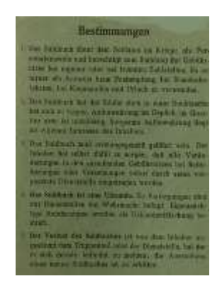
Figure 2: The last page of Turkestan Legion soldier's book

Department of the East-Kazakhstan Region. Foundation 20. Inspection and filtering documents)