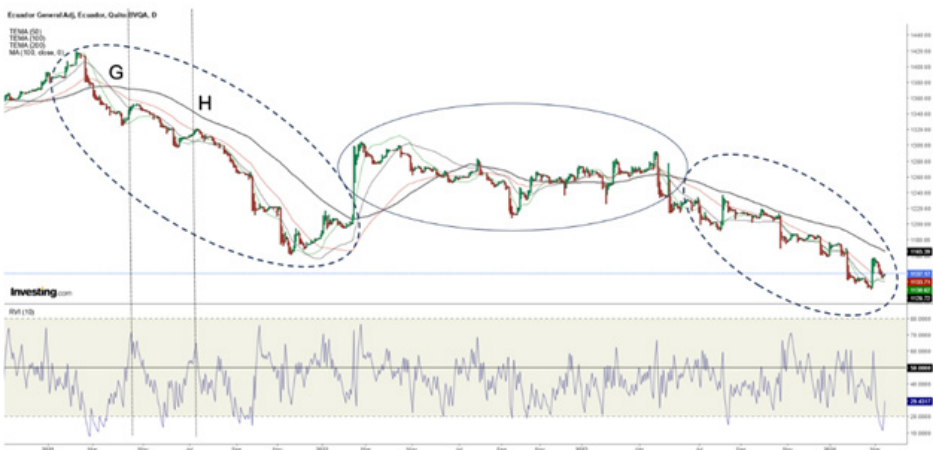
Graphic 5 Analysis and identification of trends and ranges in the ECUINDEX stock index 2021-2023

Finally, an initially bearish pattern from January to December 2021, where the price encounters resistance at the 200-period TEMA indicator, is presented in Graphic 5.