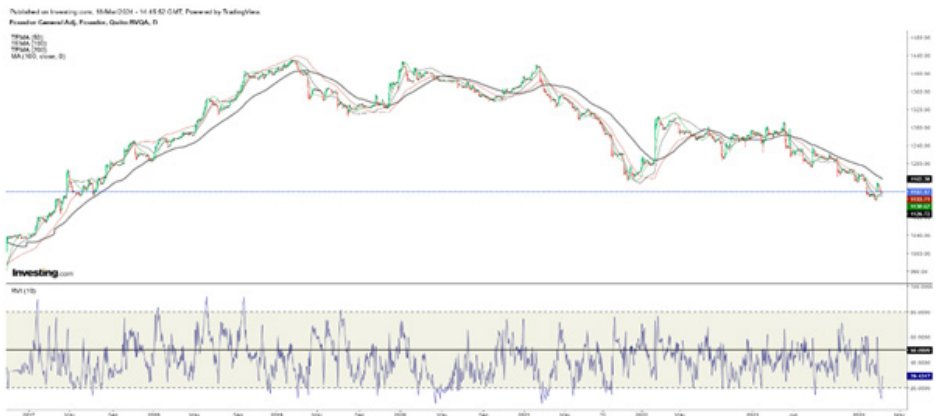
Graphic 1 Chart of ECUINDEX stock market index 2017-2023

To develop this graphic analysis for observational purposes, the behavior of the daily closing price of the ECUINDEX stock index was divided into two stages, and represented by 2 and 3. Graphic 1 shows data from 2017 to 2023, and 2, from 2013 to 2016. See both figures below.