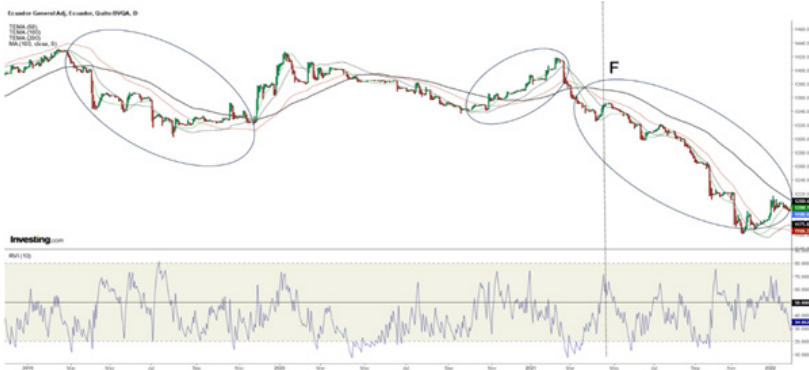
Graphic 4 Analysis of ECUINDEX stock market index 2019-2022

As demonstrated in the figure, this behavior is evidenced by the 100-period Moving Average, a key indicator in identifying temporary trend changes, where the price crosses this moving average upwards or downwards. Specifically, at the end of April 2021, a significant break to the downside is observed at “literal F,” marked by the